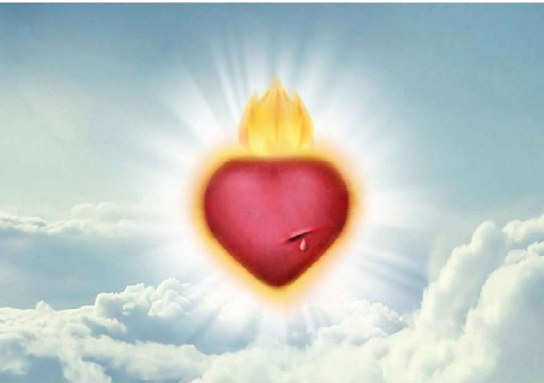
Sacred Heart of Jesus